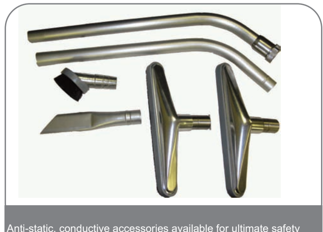
Anti-static, conductive accessories available for ultimate safety