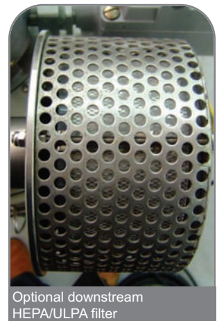
Optional downstream HEPA/ULPA filter