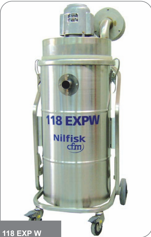
118 EXP W

Nilfisk CFM's new line of electric explosion-proof vacuums feature two separate models to meet all your cleaning needs. The 118 EXP is designed for dry material collection while the 118 EXPW is equipped for picking up liquids and other wet hazardous materials. Both vacuums are CSA approved and meet the requirements for use in Class I, Group D, and Class II, Groups E*, F, and G environments. The units are made of 304 stainless steel and feature optional HEPA or ULPA filtration.