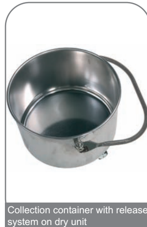
Collection container with release system on dry unit