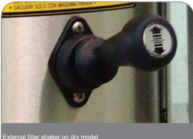
External filter shaker on dry model